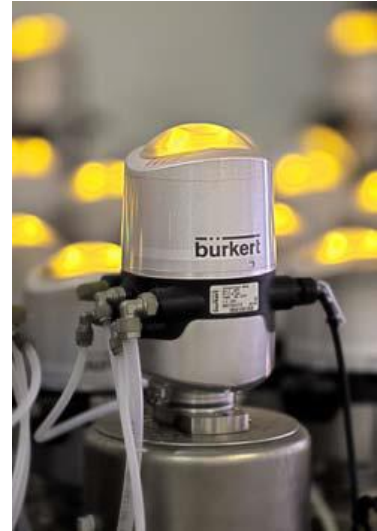
Universally adaptable control head for hygienic processes

Each process valve is connected directly to the main compressed air supply line in the field, reducing the number and length of tube and cable connections, as well as the number of required control cabinets to a minimum. The ELEMENT range of process valves are themselves designed according to the guidelines for hygienic design and easy cleaning: they feature the high IP protection required by the actual application, and are made exclusively of detergent-proof materials. As a result, they are not affected by prolonged use in environments with high levels of humidity, or by frequent cleaning cycles with aggressive chemicals.