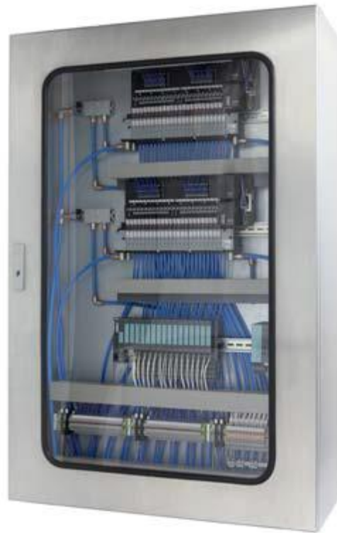
Classic control cabinet with valve terminal and automation system in a centralized solution

valves, electrical and optical position feedback and fieldbus interfaces - are integrated directly, as part of the process valves. This approach minimises the number of cables and compressed air lines. In addition, the concept is extremely flexible and provides further key features. By integrating an AS interface as a fieldbus interface, the entire scope of advantages of the intelligent valve approach can be fully utilised. All that is required for the power supply, feedback and communications is a two-wire connection, interfacing the PLC with up to 62 valves.