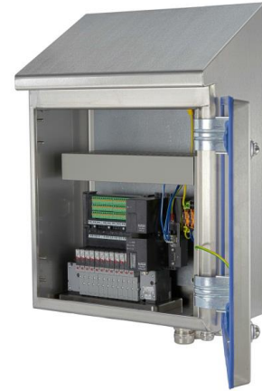
Modular valve island AirLINE Quick in HD switching cabinet

With AirLINE Quick, all pneumatic connections, the Fieldbus interface and the I/O modules can be mounted directly on the control cabinet base or side. This facility allows for an altogether smaller design of control cabinets. Additional components such as pipes, cables or control cabinet connections are eliminated, due to direct mounting, further reducing the time needed for installation and commissioning.