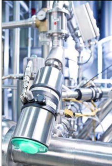
Control head ELEMENT for decentral auto- mation of pro- cess valves